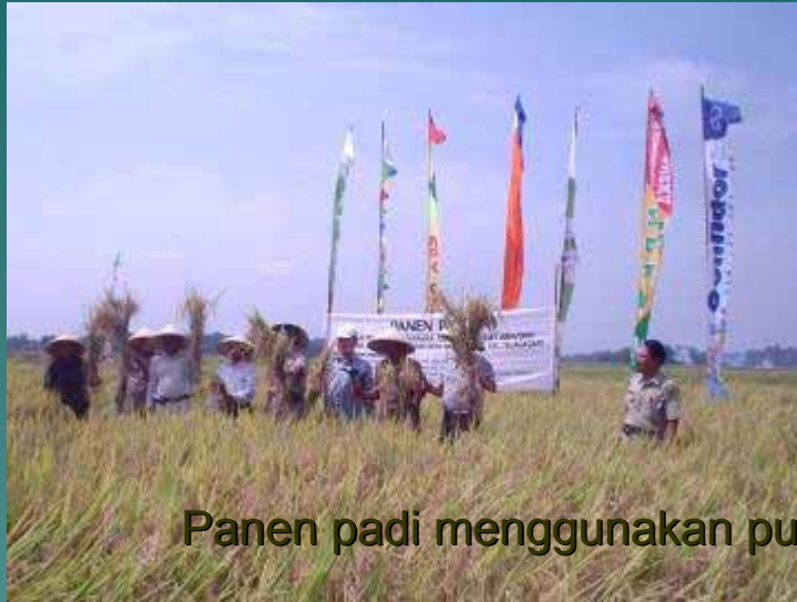
Panen padi menggunakan pupuk Rabog bersama pejabat pemerintah